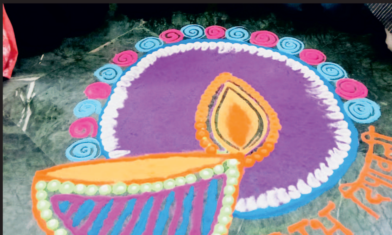
NSS Volunteers Making Diyas during Pre-Diwali Festivities